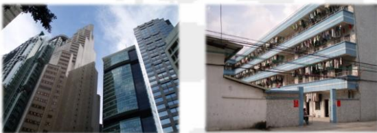
Photos 1 + 2: Companies' headquarters in Hong Kong and workers' dormitory in Dongguan

The GPRD in the province of Guangdong is one of China's most dynamic regions since the late 1970s. Due to strong prevalence and its span from low-cost to high-tech manufacturing focus of the project's research is the electronic industry. Its output in Guangdong accounted for 38 % of the national production in 2002 (Leong and Pandita 2006). Elements of the production process are regionally fragmented within the GPRD as indicated by photos 1 and 2.